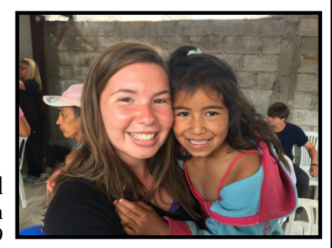
No Compromise International HCM Students attending projects in Ecuador & Kenya—2019 Wednesday, June 17, 10:30 AM