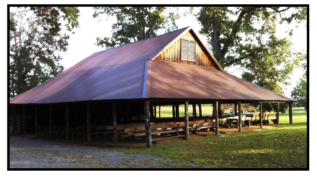
Sunday to Friday — June 14-19, 2020